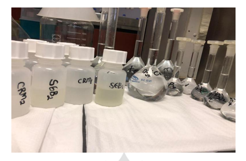
Figure No. 2: Samples of microwave digestion (analytes in plastic bottles) and prepared working standards