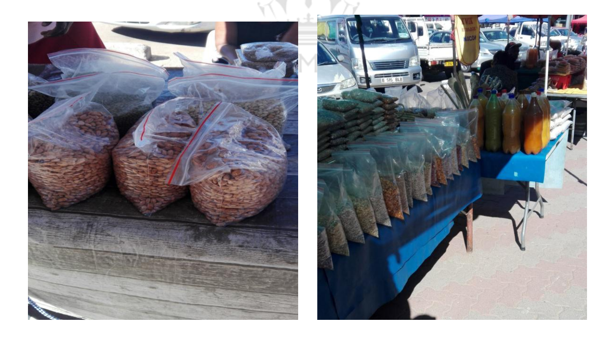
Figure No. 1: Typical marketplace on the roadside the by vendors in Gaborone

In this study, content of selected minerals was analyzed in sugar beans, lentils and groundnuts sold by the roadside as shown in figure 1 below, at the Gaborone Bus station in Gaborone, Botswana to investigate the possibility of heavy metal contamination due to human activity.