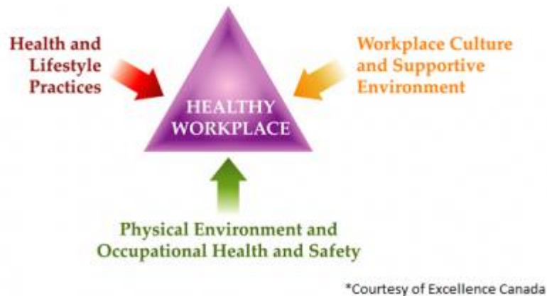
Fig 1 Healthy Workplace

Physical Environment and Occupational Health & Safety – We have had over a hundred years of legislation regarding Occupational Health and Safety. This element influences fatalities and workplace disabilities, and needs constant attention as organizations introduce new technologies, make production changes, demand more for less, and try to contain costs.