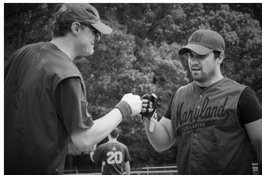
Fig 3 Team Spirit

People like working in teams. Statistics show that people are at their most efficient when they work in team's phenomena called synergy, which states that the combined output of a team is more than the output of each individual added together. Thus, it is very important to form teams, put employees in teams that will get the best out of them, form 'support groups', and promote and nurture unity. Make people in your organization feel valued. When people work in teams, they see themselves as a group that works towards the attainment of a common goal, rather than just bunch of individuals competing against each other.