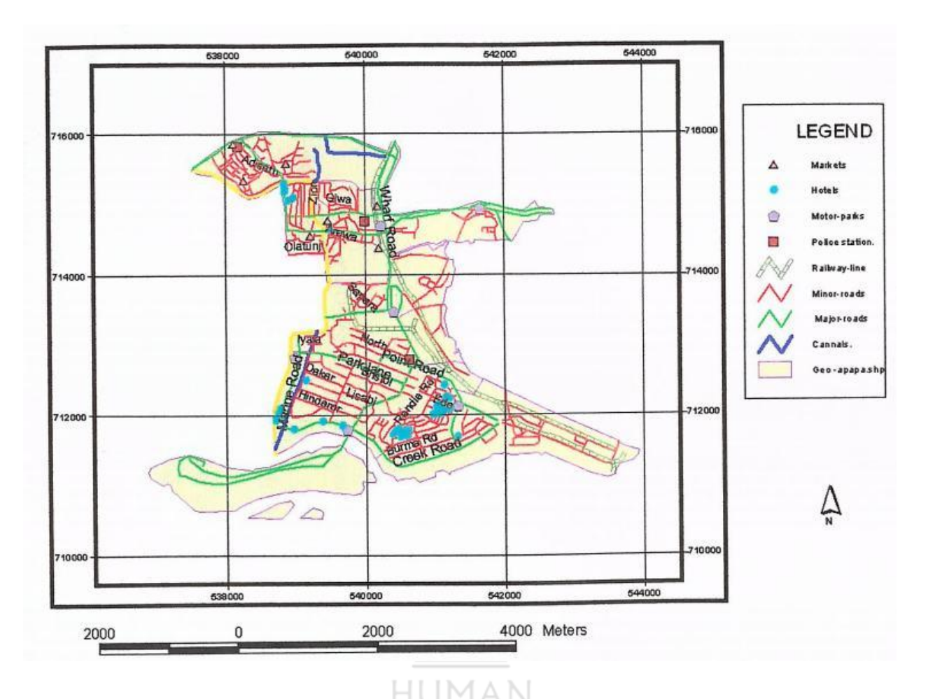
Fig. 1: Crime activities hot-spots

Others were Ijora-Oloye (63), Gaskiya (59), Marine Beach (51), Alasin/Afolabi (41), Pelewura (39), Liverpool (38), Creek Tin-Can Island (34) and the lowest was Marine ward (25). The results of the correlation analyses performed between the wards and crime rates based on the residents' opinion and available data revealed that positively significant relationship in all the wards except Pelewura and Marine wards (Table 4). On the other hand, the result further showed that not all the land-use types (Fig. 3) have significant correlation with crimes. For example, Residential (p< 0.001; r = 0.93) and commercial centers (p = 0.002; r = 0.87) showed relatively high significant (Table 5). Others which were significant were industrial areas, islands and wharf, while sandfill, lagoon, and swamp land-use types were not significant. The higher number of crimes recorded in Iganmu and Sari wards can be explained by the prevailing land-use type which is primarily the integration of residential and commercial centers. Our result was consistent with the findings of previous research which reported that combination of commercial