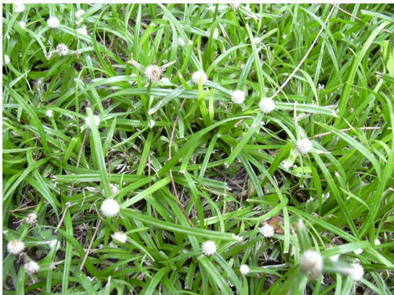
Fig 1. Kyllinga nemoralis showing white flowers