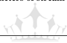
Table No. 3: Physicochemical parameters of stream water samples during dry and rainy season