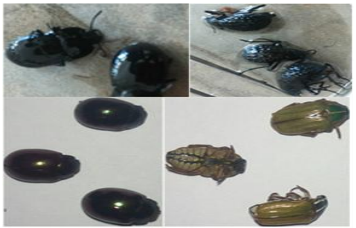
Figure 5: Some beetle species collected from MUST campus at Ikuti area

Sampling techniques which depend on insect activity, the abundance is influenced by activity, rather than density <sup>[12]</sup>. The beating sheet, hand collection and sweeping method collected a small number of beetles (Fig.5). This indicates that the data captured were influenced by the type of trap used. The large abundance of beetle individuals collected in pitfall trap is an indication of efficiency of this method although precaution should be taken when interpreting the results than for diversity because the trap can be influenced by the site and other factors. Additionally, the effectiveness of pitfall traps might be associated with the vegetation around the trap <sup>[13]</sup>. The pitfall traps captured most beetle specimens that move on the ground, for example, Pterostichus melanarius (Carabidae) was captured mainly in the pitfall traps. Furthermore, it is important to understand that the best sampling of beetles needs a combination of different trapping methods <sup>[12]</sup>.