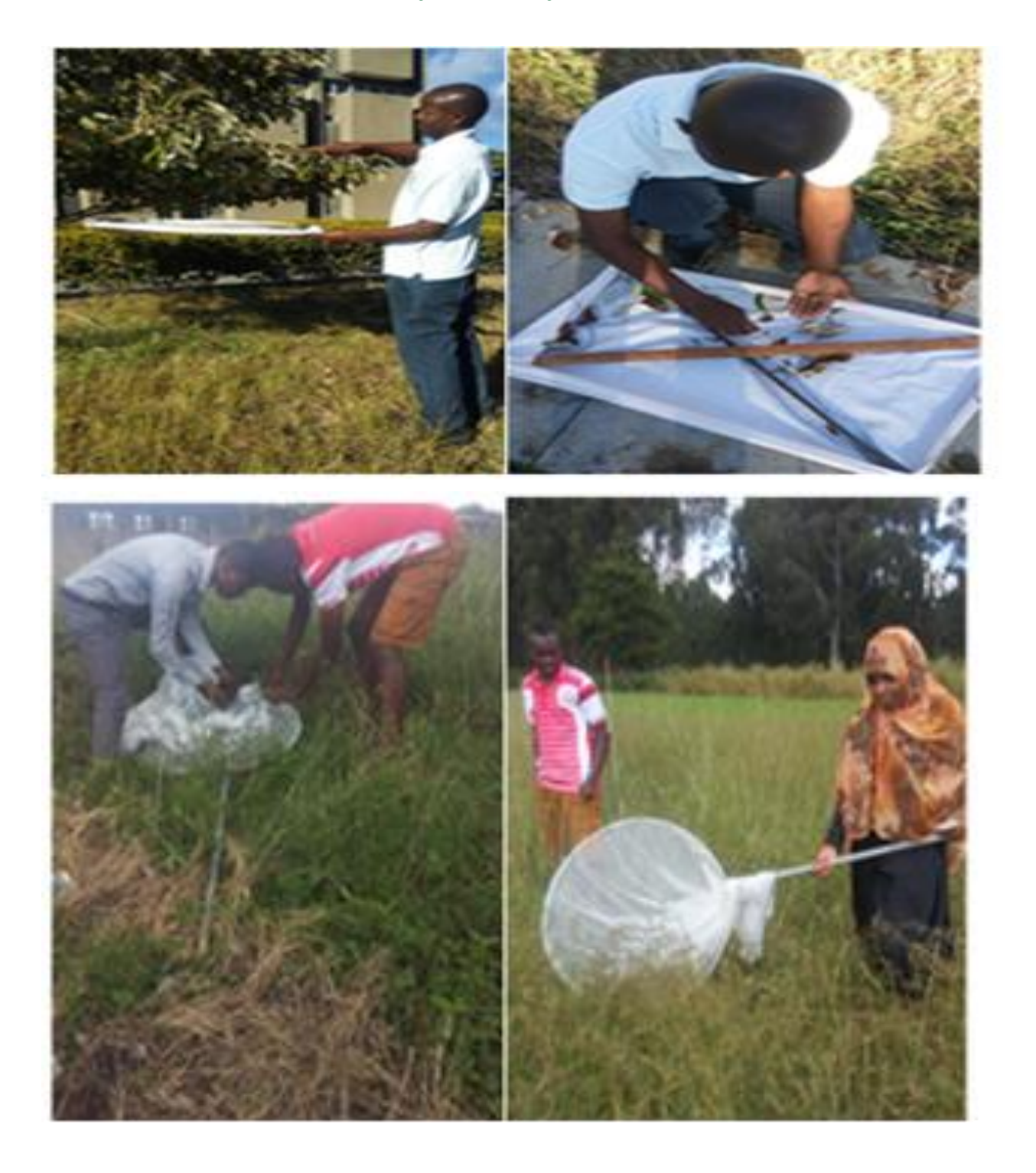
Figure 3: Collection of beetles using sweep nets